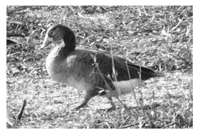
Hybrid Goose seen at Monday Morning Bird Walk - September 18